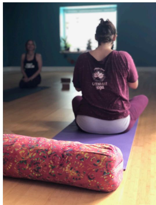
Jasmine Road Resident practicing therapeutic yoga Greenville Yoga