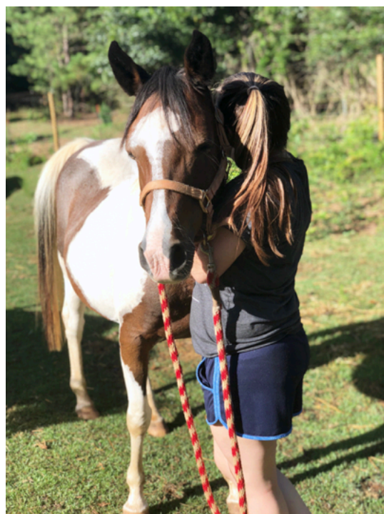
Jasmine Road Resident partaking in Equine Therapy at Black Sheep Farms